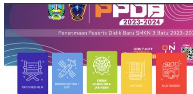
Picture4. High fidelity web

creates form stages of social media analysis used to measure the success and effectiveness of each social media campaign carried out together with the social media team at Virtual Consulting. Following illustration of a social media analysis model which is called the 3 layers of social media analysis: Media Analysis consists of 3 main matrices, namely reach, engagement, and virality. Reach measures our reach to the audience, an example is total fans or followers, total views/unique views and information regarding demographics or behavior from the reach of that audience. Then the second matrix is engagement. This matrix is trying to measure how much activity in creating content is also by how much content to get feedback from the audience (Safko, Lon & Brake, 2009).