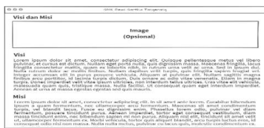
Picture3. Low fidelity web